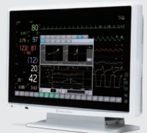
Life Scope G9