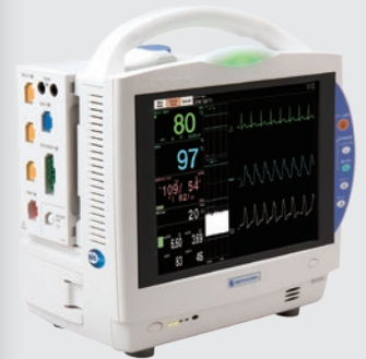
Life Scope TR